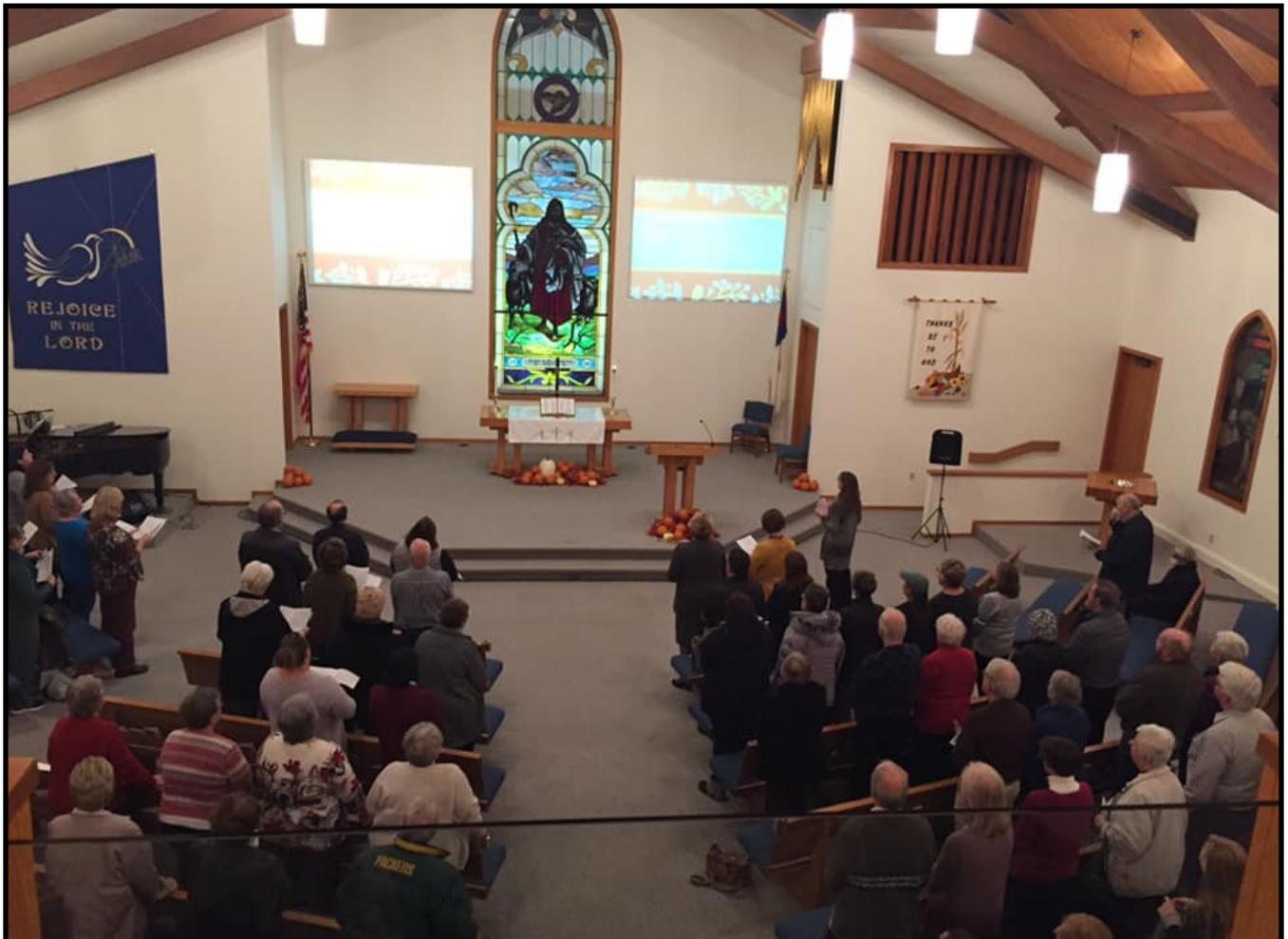
Just over one hundred Christians of various denominations gathered for the November 26 Ecumenical Thanksgiving Service hosted by 5 area churches and A Place to Be. It was a beautiful service of gratefulness. A pie feast was served following the service.